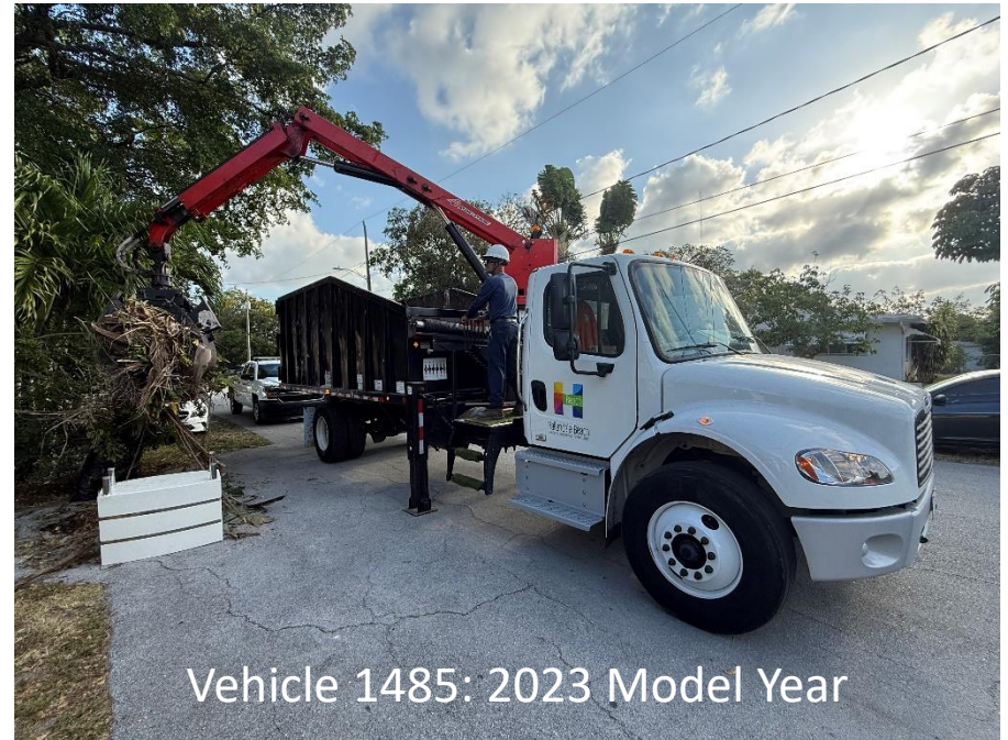
Vehicle 1485: 2023 Model Year