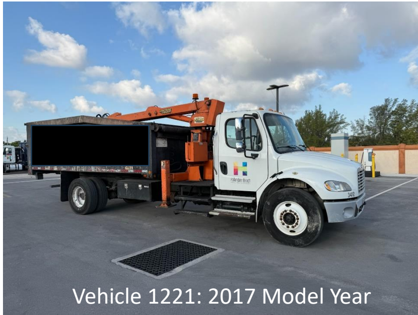
Vehicle 1221: 2017 Model Year