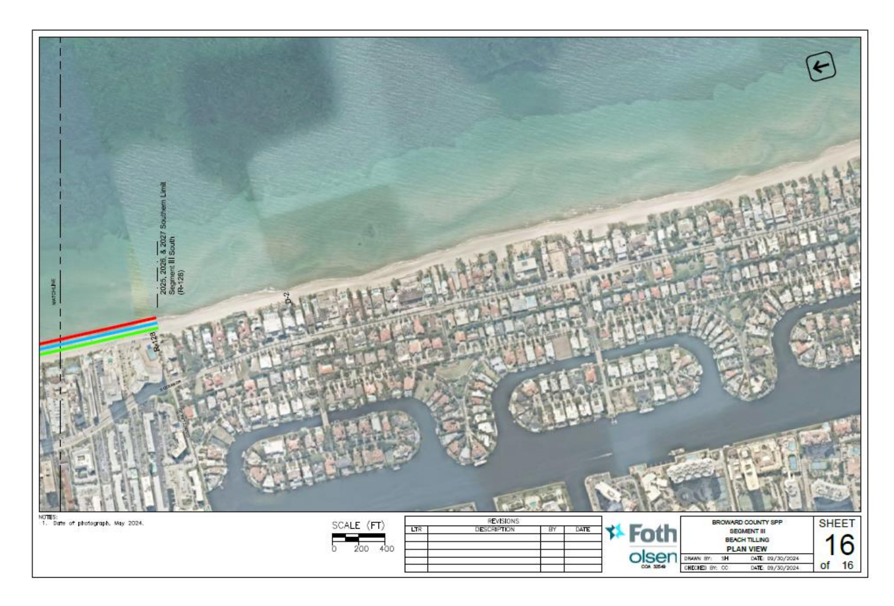
Page 12 of 13