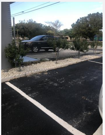
Kora Group Services 412 S. Dixie Highway