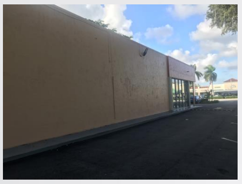
Planet Wash, LLC 727 W Hallandale Beach BLVD.