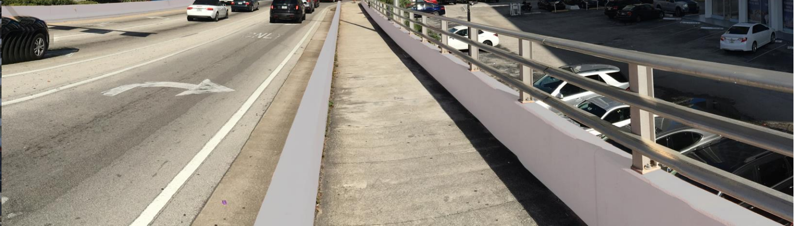
HALLANDALE BOULEVARD EASTBOUND - PROPOSED