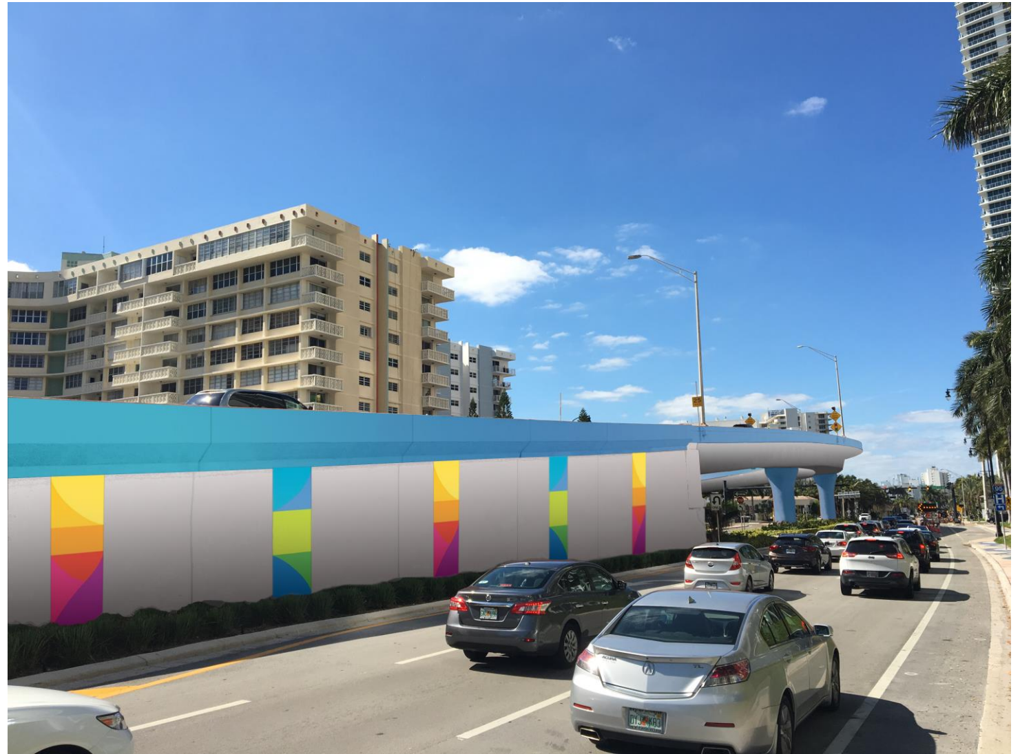
A1A NORTHBOUND - PROPOSED