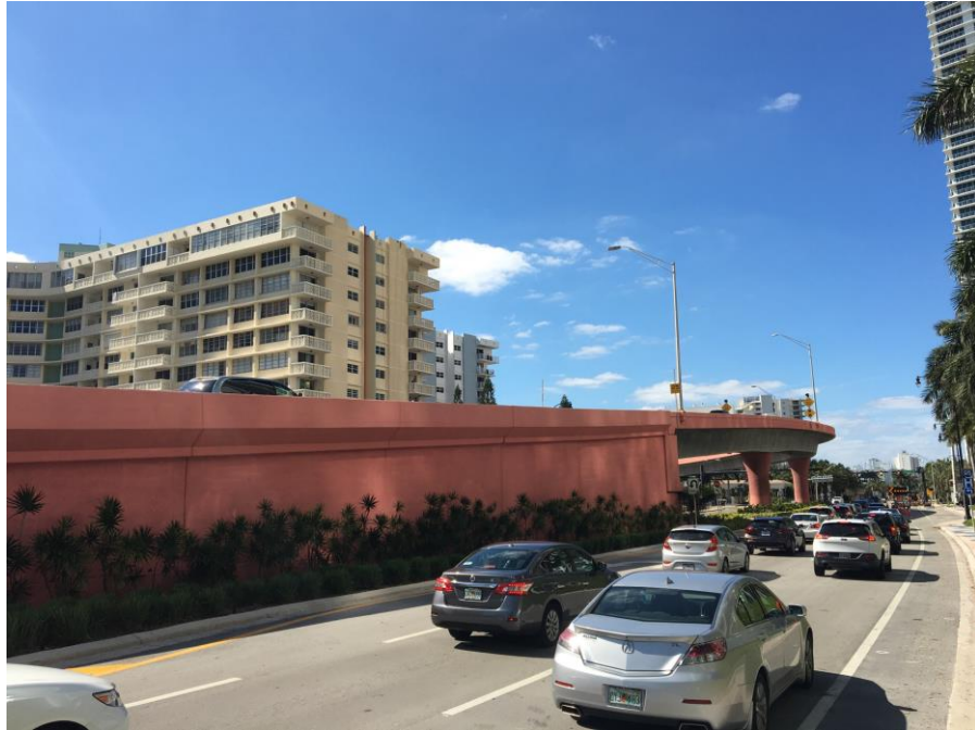
A1A NORTHBOUND - EXISTING