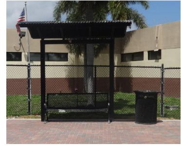
All Metal Bus Shelters