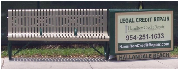
Benches with ad