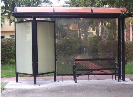
Bus Shelter with Ad Box