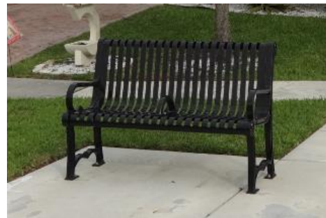
Benches with no ad