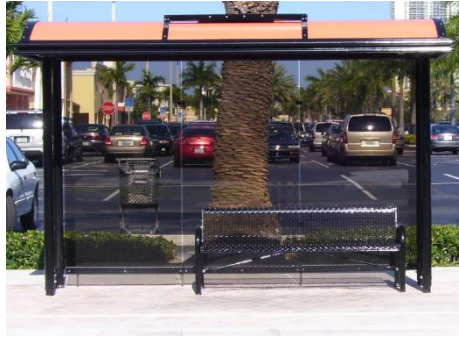
Non Ad Bus Shelter