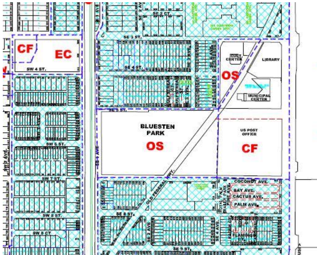
FIGURE 1. ZONING MAP

The Bluesten Park project is a city project surrounded by the Central RAC District (Transitional Mixed Use) to the north, south and west. The existing US Post Office is located to the East with a Community Facility (CF) zoning and the existing Municipal Complex, zoned Open Space (OS) is to the northeast. However, the zoning for the project is zoned as Open Space (OS) which have different requirements than the Central RAC District.