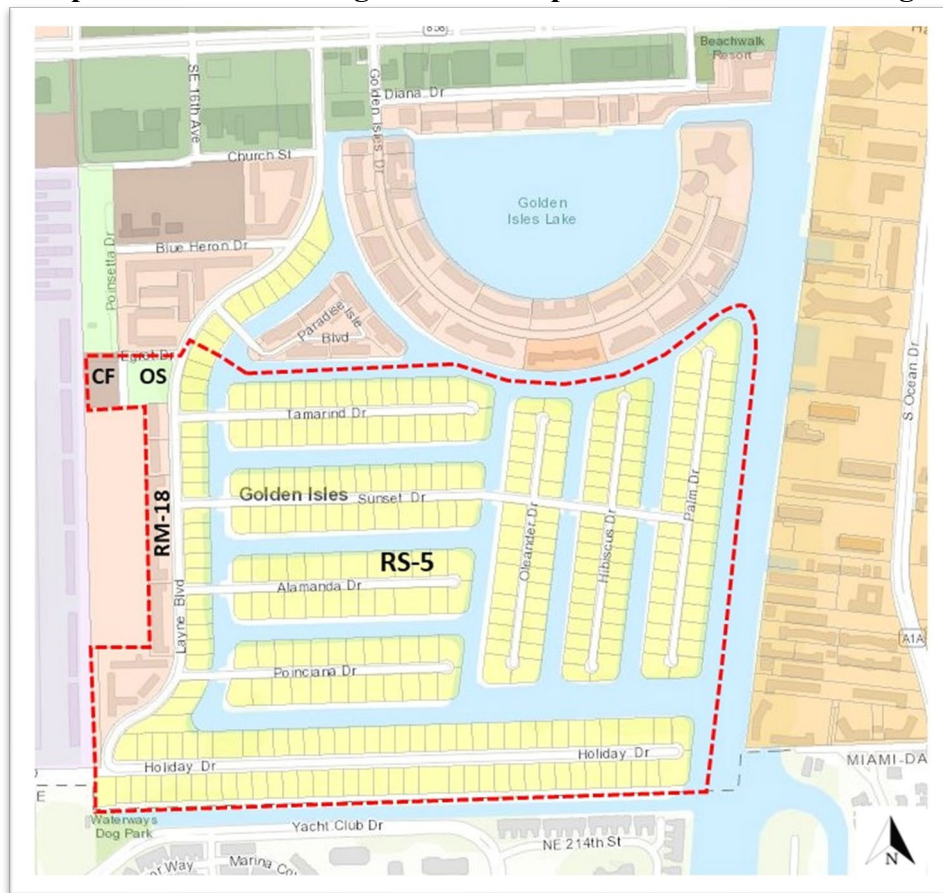
Map 3: Golden Isles Neighborhood Improvement District Zoning Categories