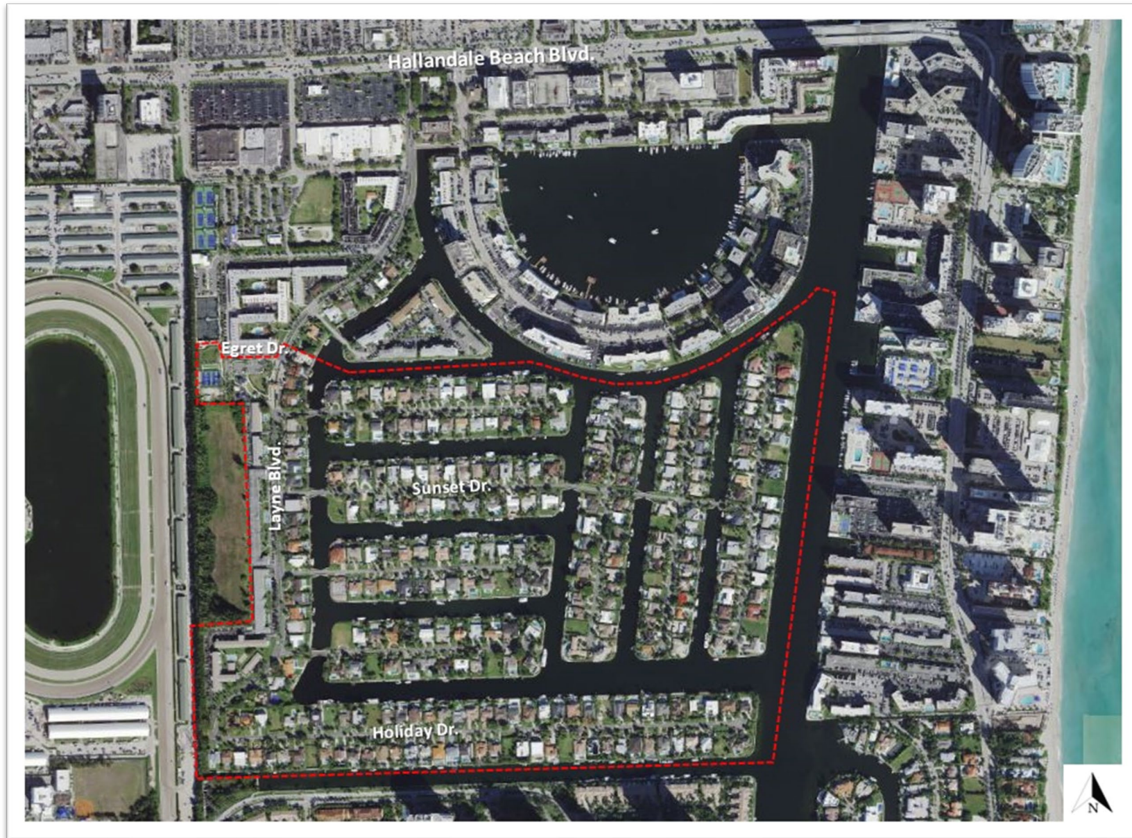
Map 1: Golden Isles Neighborhood Improvement District Aerial