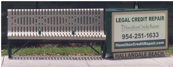
Benches with ad